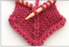
Centered Double Decrease

Published on Sunday, 01 April 2012 21:11