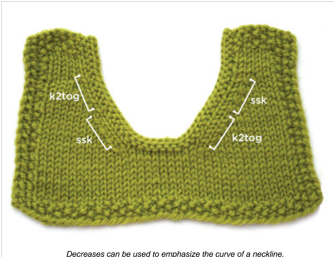
Decreases can be used to emphasize the curve of a neckline.

In the raglan sample, the lower half has k2tog to the right of the seam, and ssk to the left of the seam. The upper half has ssk to the right of the seam, and k2tog to the left. Again, decreases that slant away from the edge create a strong line. Decreases that lean into the edge are less obvious.