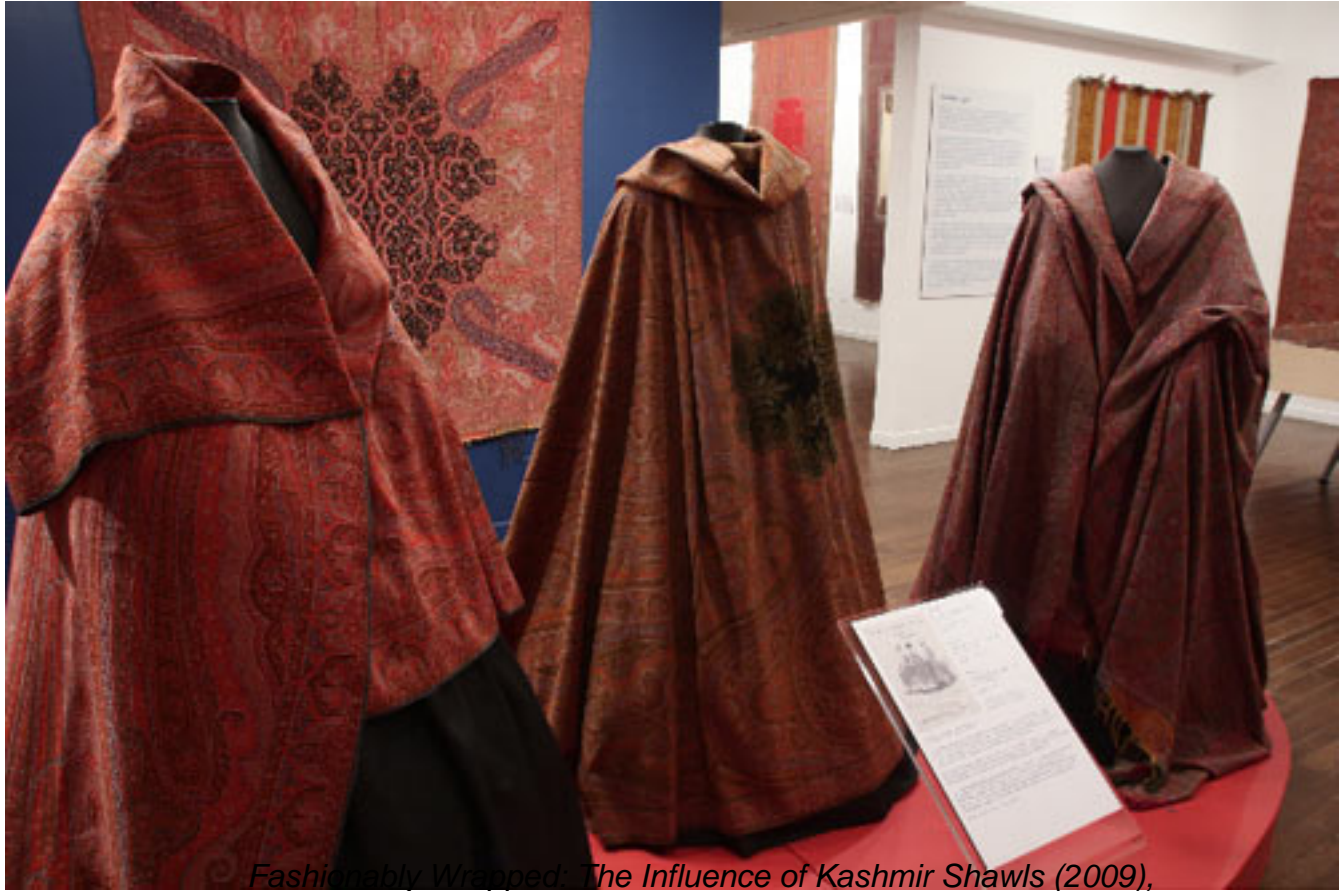
Fashionably Wrapped: The Influence of Kashmir Shawls (2009), Textile Museum of Canada . Photo: Jill Kitchener

During the nineteenth century technological advancements in Jacquard loom weaving wielded its influence over paisley design. Older looms limited paisley patterns to five to six inches (12 to 15 centimeters) in size, but the more modern looms made it possible for one repeat to cover the whole shawl. This ability to create a larger design tied in quite nicely to the changing silhouette of women's dress. At the beginning of the century an artistically draped shawl added interest to the simple silhouette of the Empire-line gown. But as waistlines fell and the leg-o-mutton sleeve ballooned into vogue, the shawl, folded carefully to display all four borders, created a pleasing silhouette that emphasized the shoulders. The ever-increasing width of crinoline skirts had ladies discarding their coats and donning shawls for warmth as well as fashion. The large centered motifs, made possible by the new looms, were shown to their best advantage over such a wide expanse.