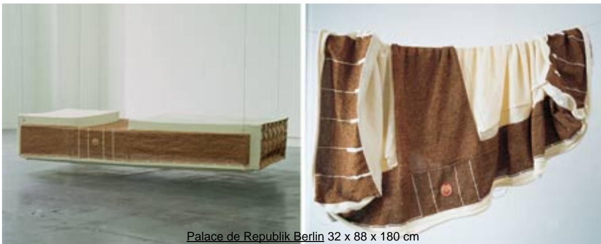
Palace de Republik Berlin 32 x 88 x 180 cm

Some of Streyll's buildings have more localized impact. New York's Sony Tower (formerly the AT&T building, designed by Philip Johnson) starkly stretches to end in the ornamental "Chippendale" rooftop cutout so familiar to dwellers of the city's five boroughs. (In its armature-less form, it's reduced to a compelling pattern of black-and-white gridwork.) The Lurex-flecked "twin towers" of Frankfurt's Deutsche Bank, among the best-known buildings in Germany, are often referenced by newspaper editorialists as symbols of economic prosperity. Off the framework, Streyll's knitted versions resemble nothing more than a pair of collapsed stockings. So much pomp and power, revealed with knitting to be so much puffery.