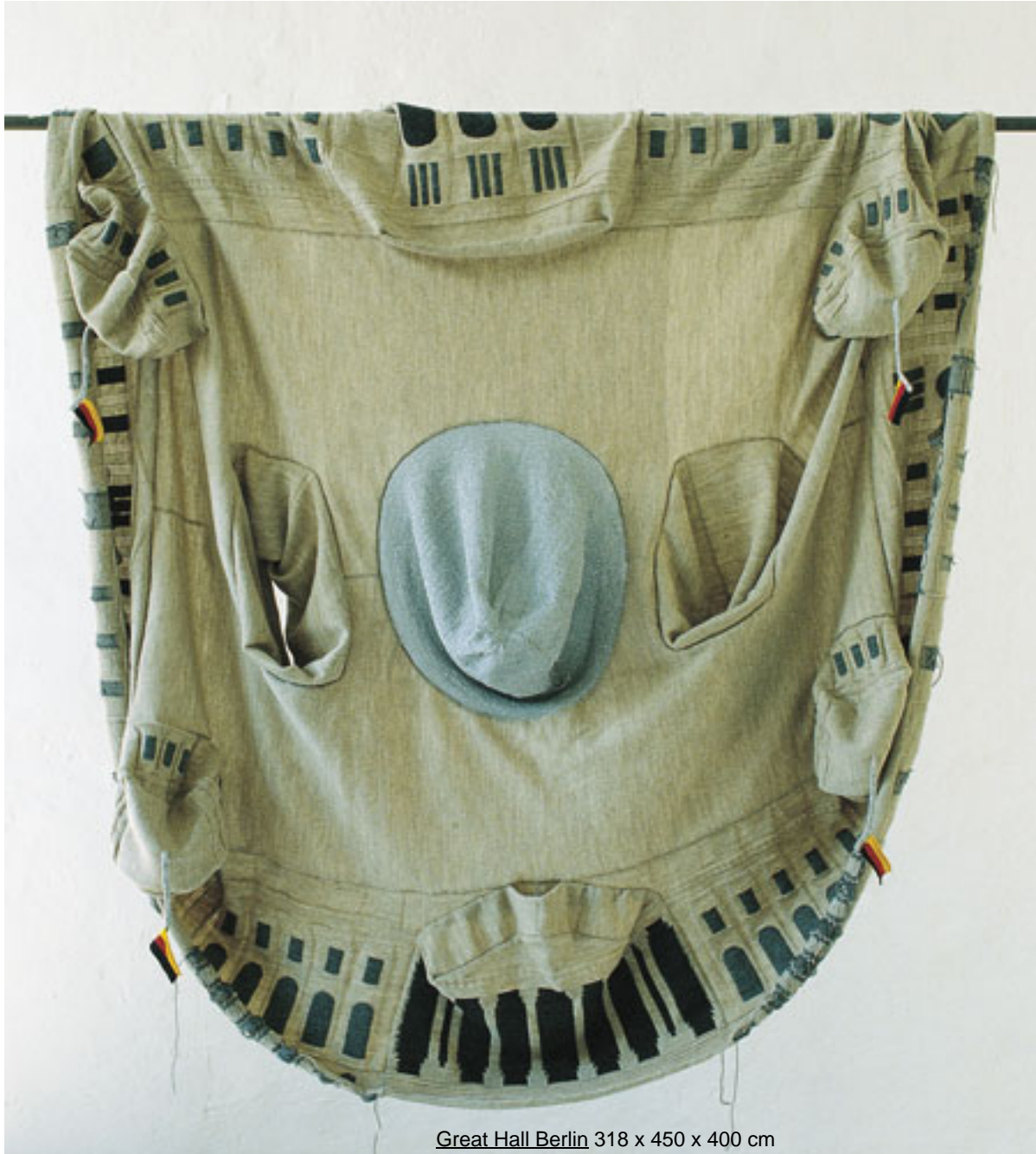
Great Hall Berlin 318 x 450 x 400 cm