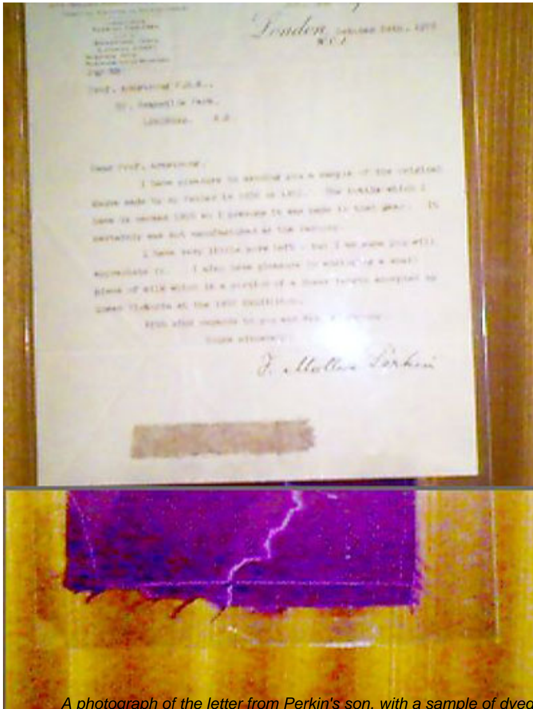
A photograph of the letter from Perkin's son, with a sample of dyed silk. - Henry Rzepa

Thanks to factory production, the shade once reserved for only the very wealthy was now in the hands (and clothing) of the masses. But with the introduction of more aniline dyes (fuchsine, safranine and induline, to name just a few), mauve eventually fell out of fashion favor. Mauve began to be associated with death—thanks to both to the poisonous nature of the aniline dyes used to create it and Queen Victoria's decision to wear the color during the half-mourning for her