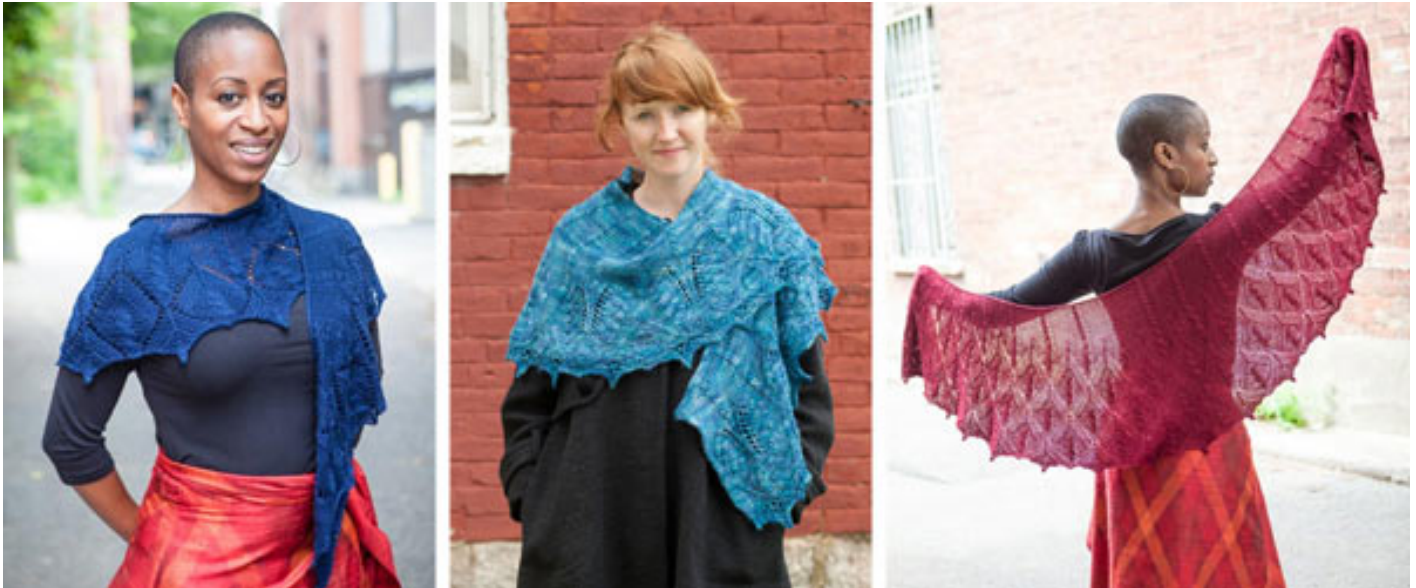
( Cerris (two versions), Derwen )