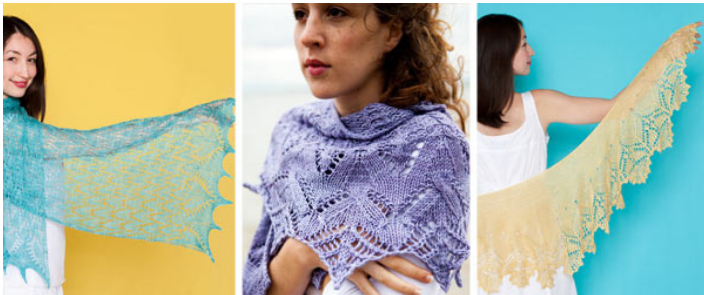
(top: Giardina , Geada , Stellaria , bottom: Tendrils (two versions))