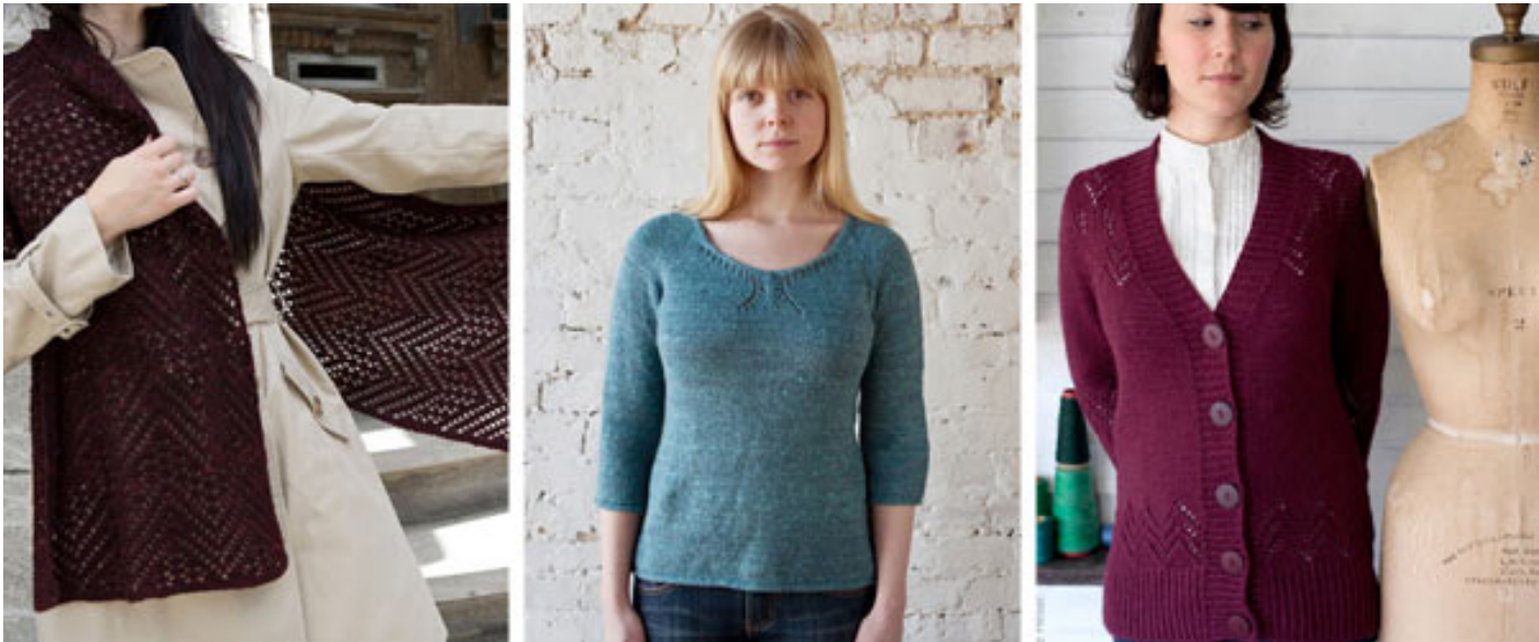
(Caprio, Clearwing, Fireside)