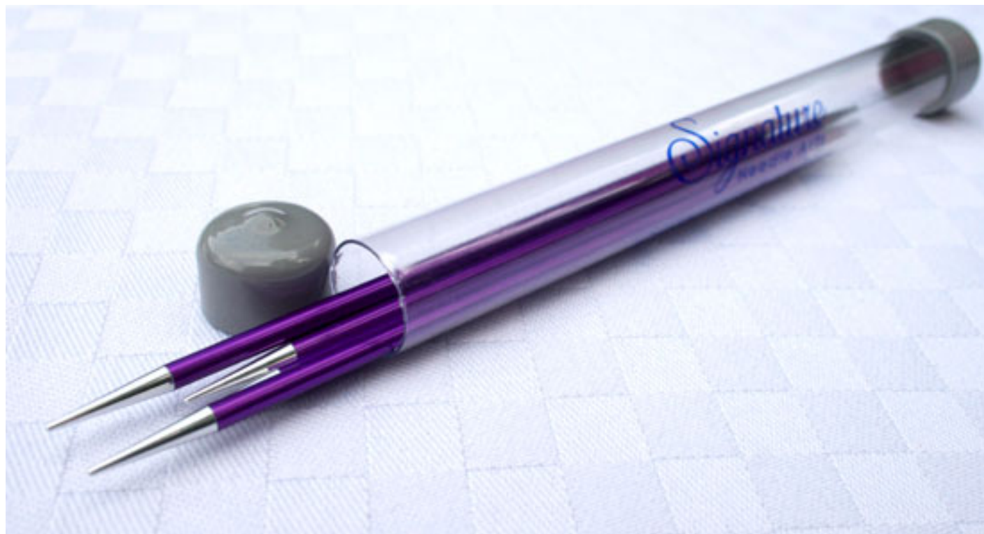
Signature Needle Arts DPNs Size US 4/3.5mm (and the Twist Collective pattern of your choice)