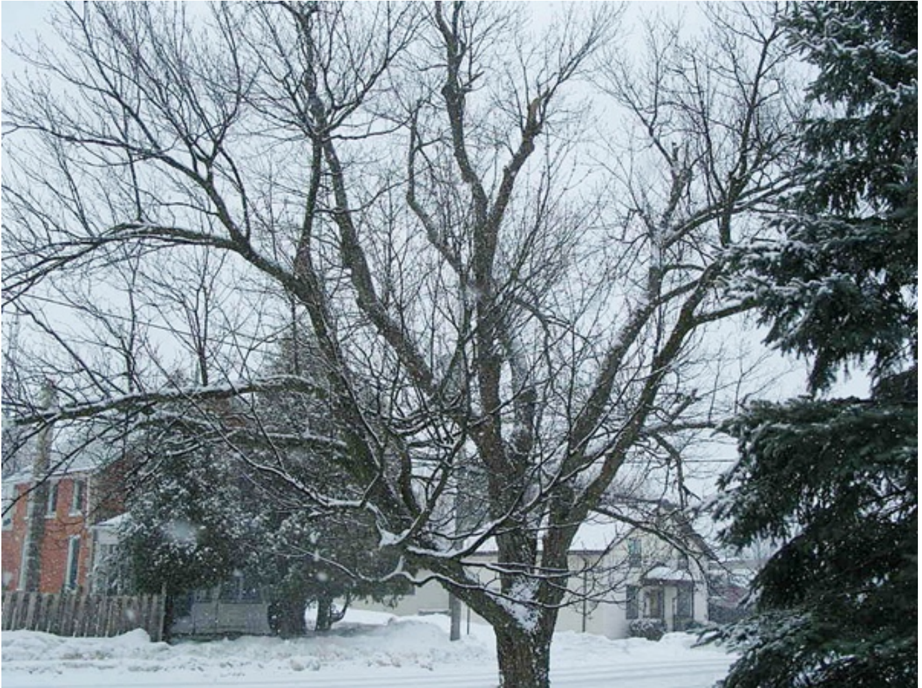
A snowy day in Athens, Ontario

With my head up and eyes closed, I could feel the cold snow flake on my face and in that moment I'm in the Lantern field in Narnia and I'm in the forest of Snow Queen.