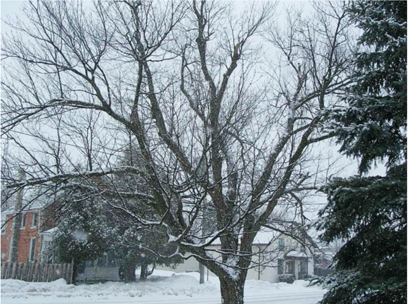
A snowy day in Athens, Ontario

With my head up and eyes closed, I could feel the cold snow flake on my face and in that moment I'm in the Lantern field in Narnia and I'm in the forest of Snow Queen.