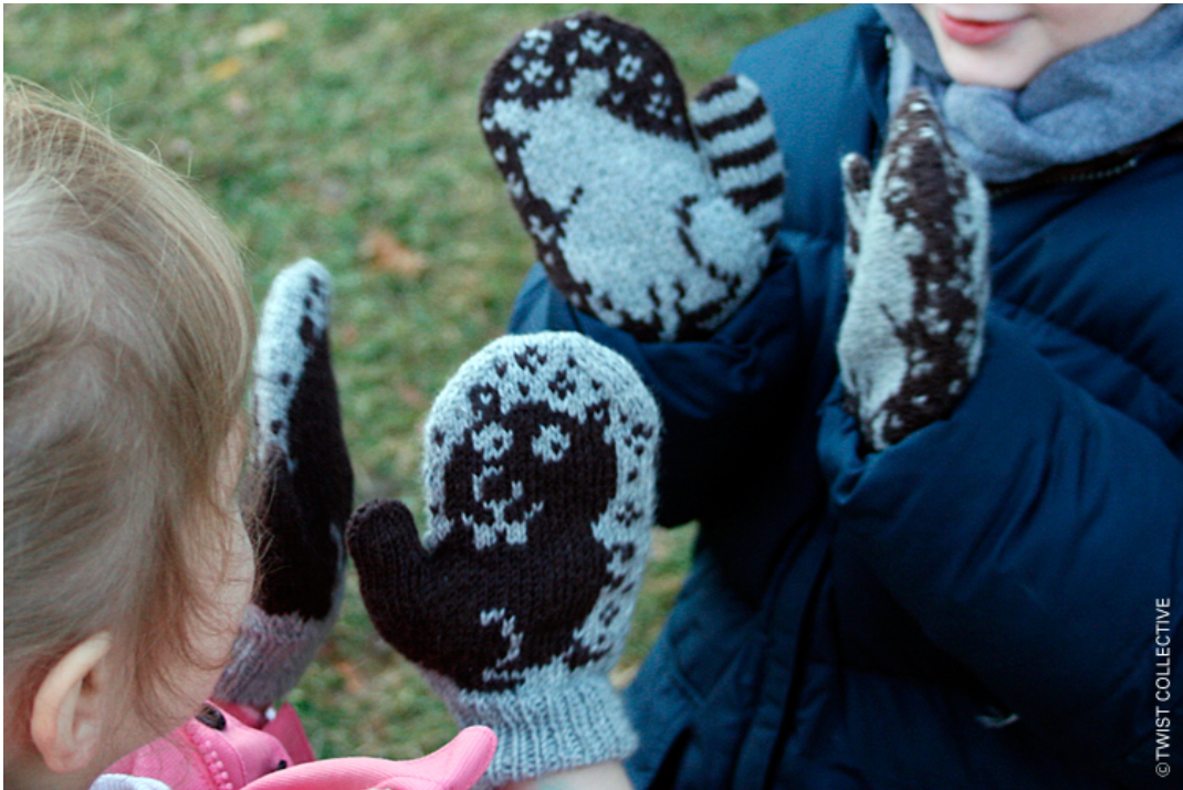
Find out more about Ringo & Elwood here .