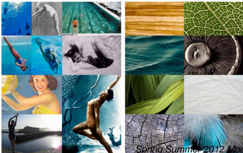
Spring Summer 2012 Mood Board

Our mood boards don't focus on specific garment shapes or styles. We have found that when we put a garment in a mood board, we get tons of submissions that are just variations on that design and while there's nothing wrong with that, it feels like it actually limits people's creativity instead of sparking it. Instead, we focus on feelings like, top-left: light and airy or bottom-right: texture. We might want people to think of a technique in a new way like top-right: lace, or design for a situation like bottom-left: poolside. When an idea cannot be literally translated into a design, we find that people abstract the concept into something that is uniquely their own. It's always inspiring to see what people have come up with.