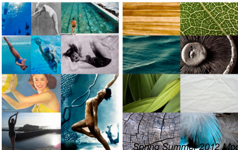
Spring Summer 2012 Mood Board

Our mood boards don't focus on specific garment shapes or styles. We have found that when we put a garment in a mood board, we get tons of submissions that are just variations on that design and while there's nothing wrong with that, it feels like it actually limits people's creativity instead of sparking it. Instead, we focus on feelings like, top-left: light and airy or bottom-right: texture. We might want people to think of a technique in a new way like top-right: lace, or design for a situation like bottom-left: poolside. When an idea cannot be literally translated into a design, we find that people abstract the concept into something that is uniquely their own. It's always inspiring to see what people have come up with.