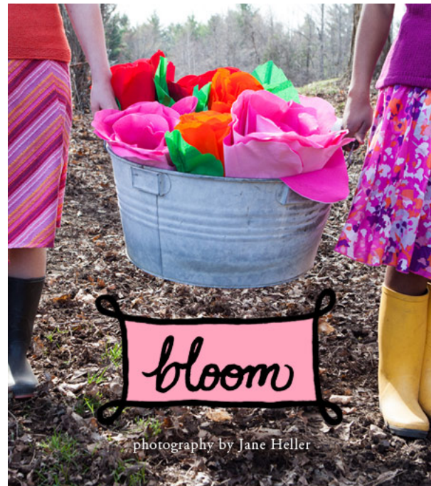
April Showers Bring May Flowers, with a little peek at Regent , Ceylon and Caeles

In order to ensure we have designs that can be grouped together, our mood boards also feature themes. These themes may or may not relate to the final shoots. More about that in future posts.