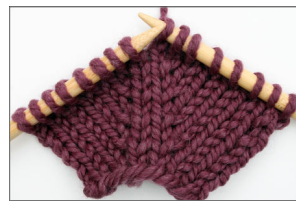
Twisted Yarn Overs

Download a handy pdf with Increasing Your Options and instructions for all of the increases