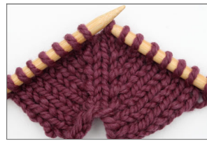
Make 1 (Left or Right)