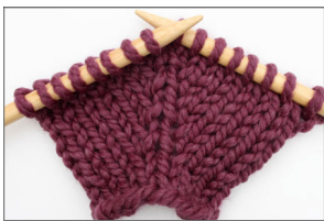
Lifted Increases (Left or Right)