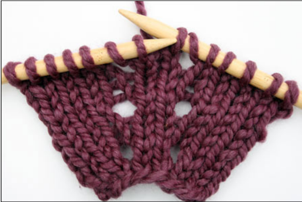
In this swatch, the yarn over is worked every fourth row.

Yarn overs are easy to work and won't disturb the stitches on either side of the new stitch, but they also create a hole in the fabric. Some knitters view this as an effective decorative detail. If you prefer your increases to be less apparent, you have lots of options. See how to.