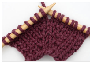
Knit in the Front and Back of the Stitch