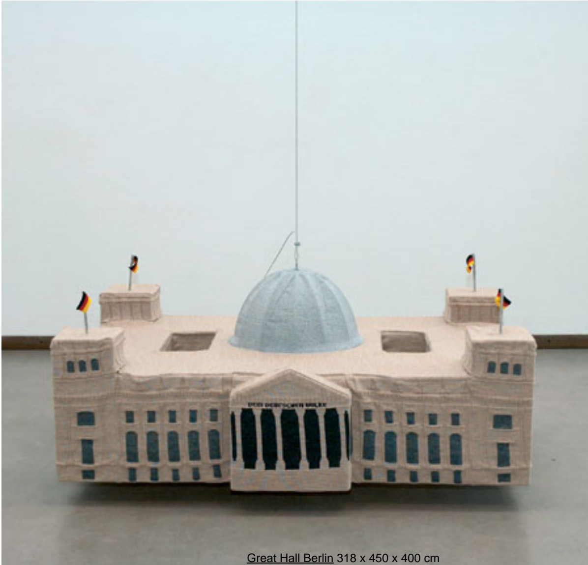
Great Hall Berlin 318 x 450 x 400 cm