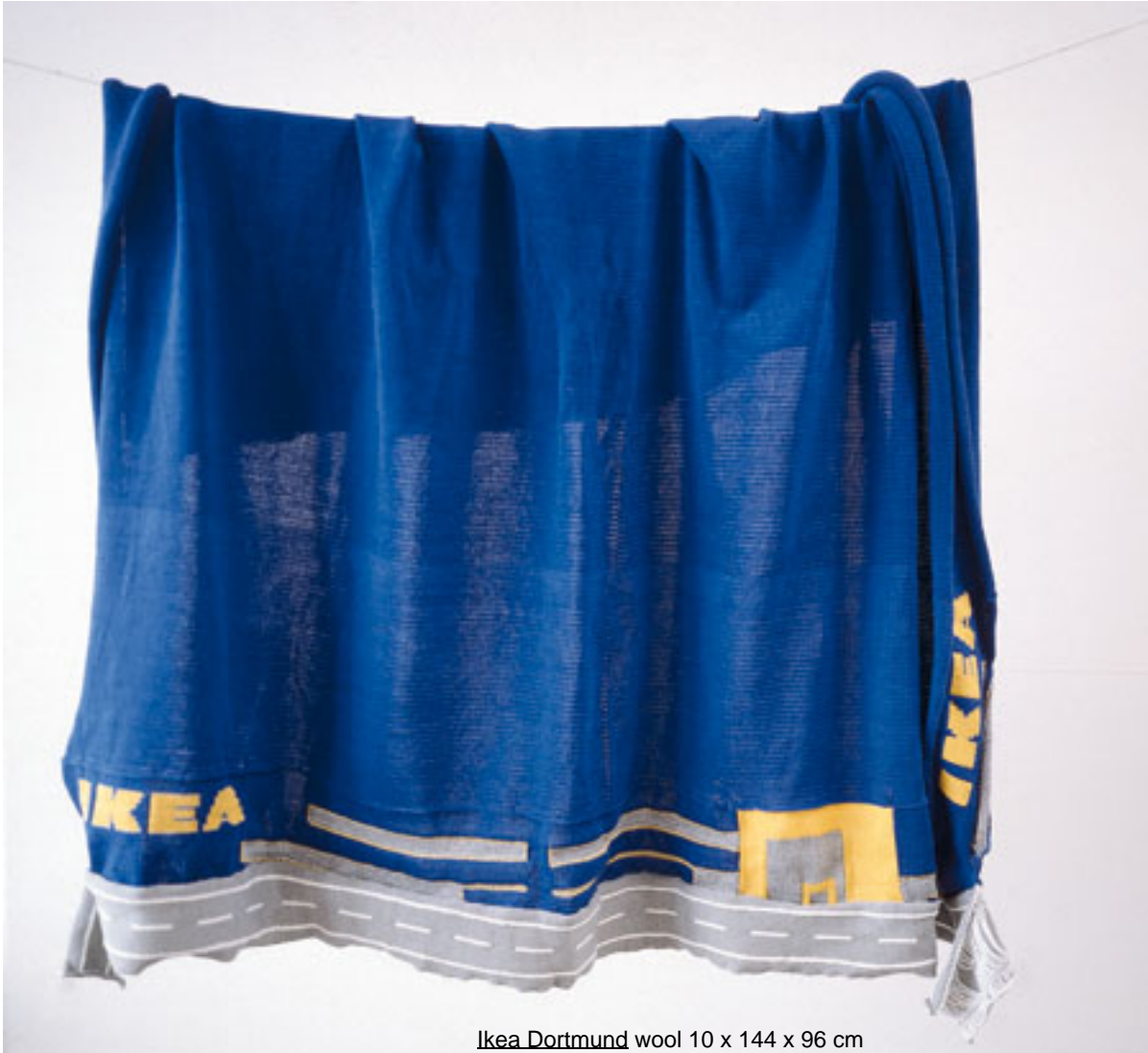
Ikea Dortmund wool 10 x 144 x 96 cm