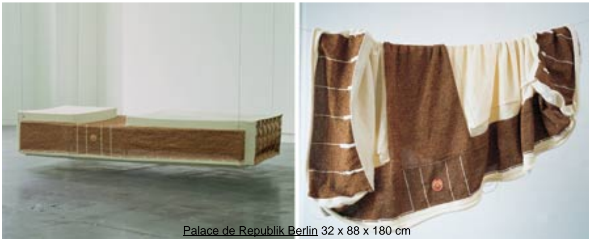
Palace de Republik Berlin 32 x 88 x 180 cm

Some of Streyll's buildings have more localized impact. New York's Sony Tower (formerly the AT&T building, designed by Philip Johnson) starkly stretches to end in the ornamental "Chippendale" rooftop cutout so familiar to dwellers of the city's five boroughs. (In its armature-less form, it's reduced to a compelling pattern of black-and-white gridwork.) The Lurex-flecked "twin towers" of Frankfurt's Deutsche Bank, among the best-known buildings in Germany, are often referenced by newspaper editorialists as symbols of economic prosperity. Off the framework, Streyll's knitted versions resemble nothing more than a pair of collapsed stockings. So much pomp and power, revealed with knitting to be so much puffery.