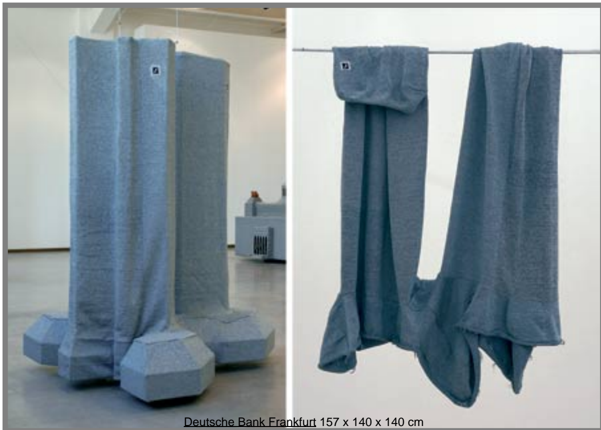
Deutsche Bank Frankfurt 157 x 140 x 140 cm © 1999 Annette Streyll

More accurately, her knittings are skins of buildings—and Streyll makes much of this distinction. Sometimes they are exhibited stretched over armatures; others they are strung, billowy and strange, over lines as though they were so much bulky handwash left out to dry. Both versions manifest a certain weightless quality—the sagging hides because you can almost hear the hissing of air that would accompany their deflating; the structured ones because Streyll suspends them several inches off the ground when exhibited, so they hover like impossible dirigibles.