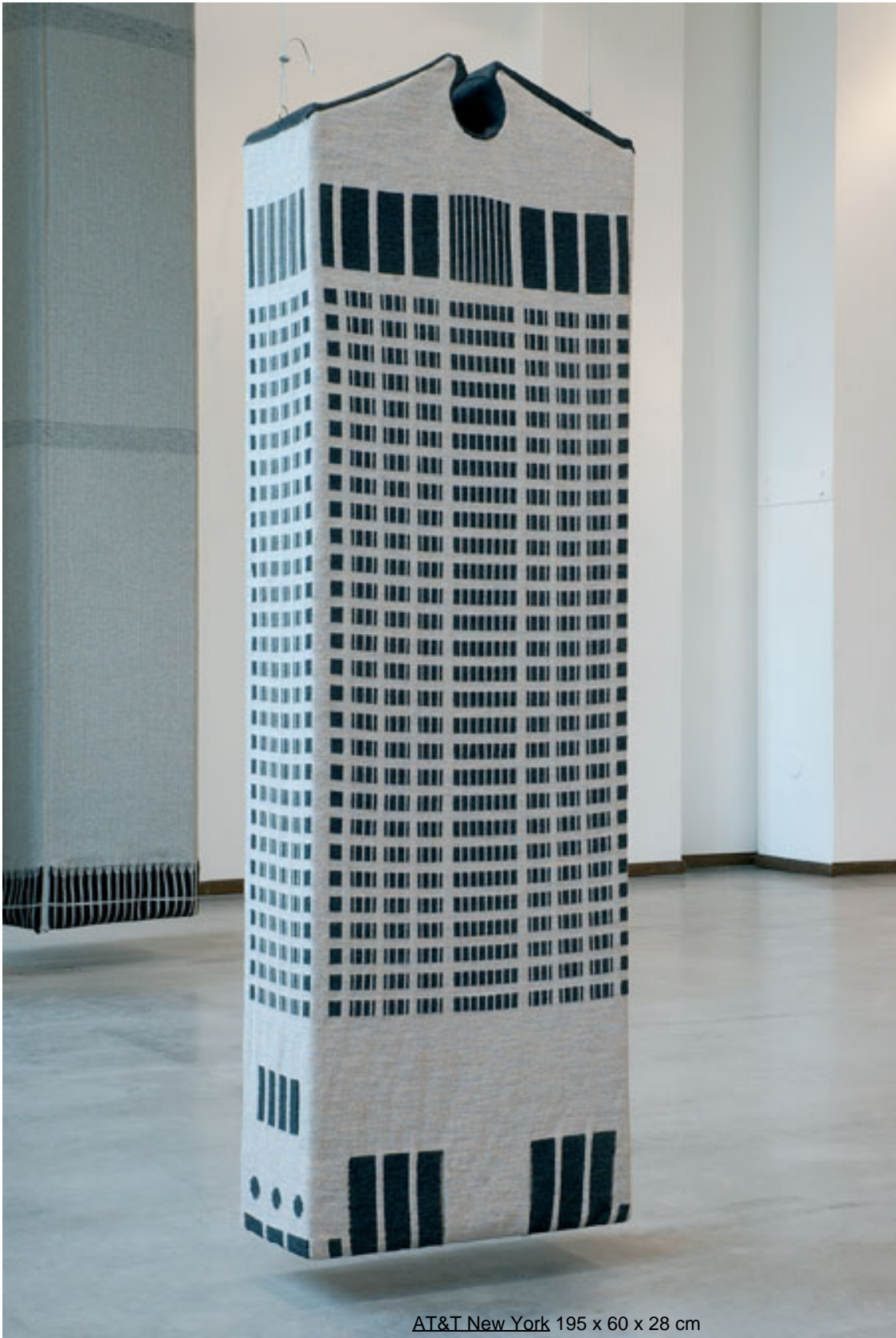
AT&T New York 195 x 60 x 28 cm