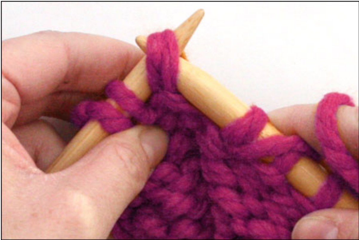
Slip the two slipped stitches back to the left needle in their new orientation.