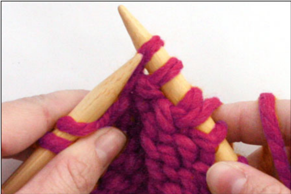
Slip two stitches, one at a time as if to knit.