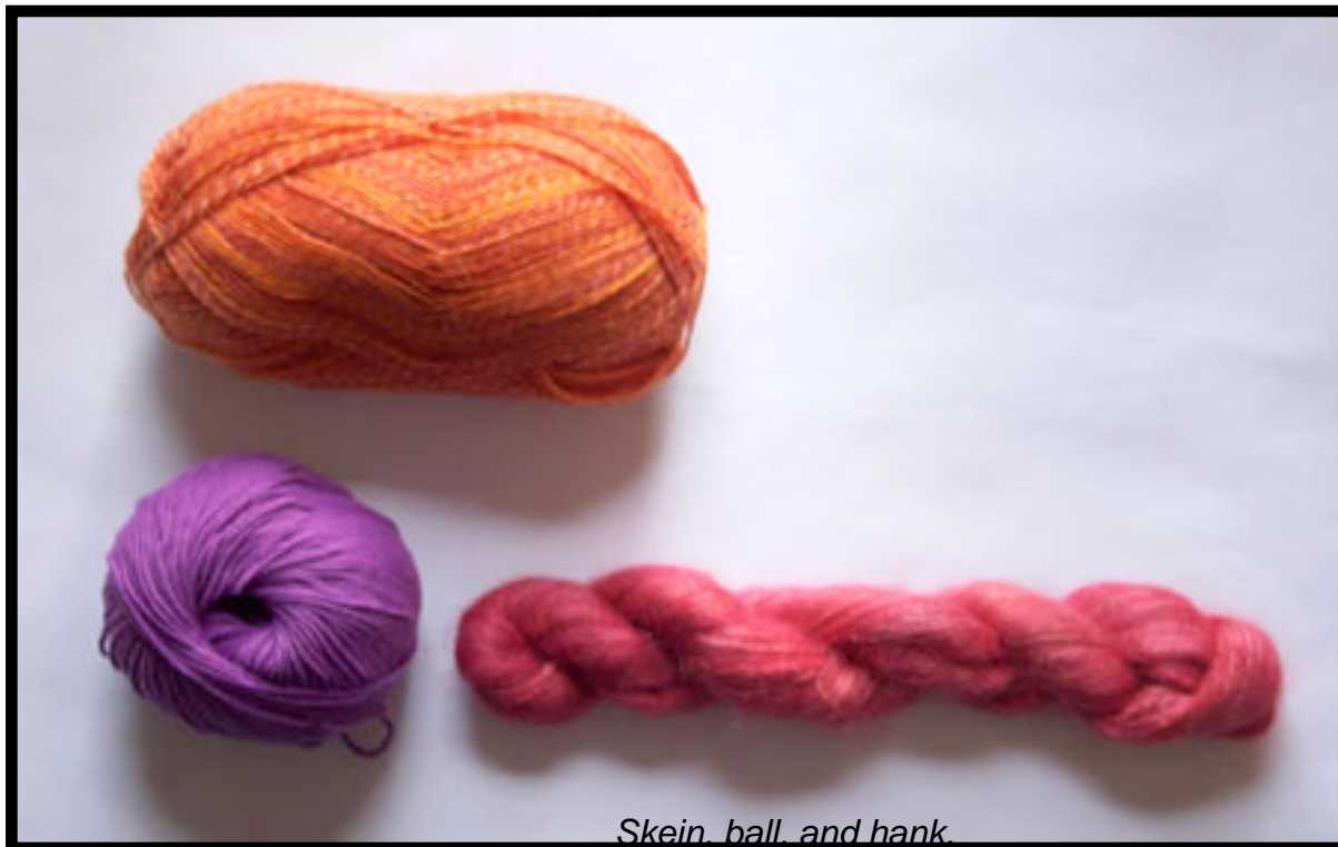
Skein, ball, and hank.

Repeat after me: If your yarn comes in a pull skein, in a ball or on a cone, there is no need for you to re-wind it. You can work right from the skein. If your yarn comes in a twisted hank, you'll find that it opens up into a large loop. If you try to work directly from this loop, you're likely to create a horrific tangle. Put the loop on a swift, or over the back of a chair, and wind it into a ball, either by hand or with a ball winder. I have a friend who often skips the ball-winding step. She sets up her swift on the table next to her knitting chair and knits the yarn off the swift. Not a great option for knitting on the go, but it works for her. Of course, she lives alone and doesn't have cats.